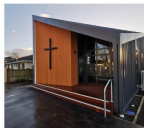
Plaque / Name Plate